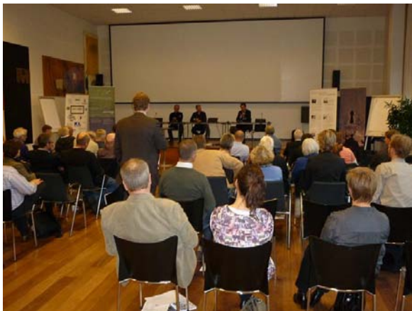
Picture from the panel discussion at the SETatWork matchmaking event

The event helped to bring together the different type of actors where a fruitful interaction is essential in order to put such policy into practice. As part of this it gave the company members of the Zero Carbon Network and other present industry representatives an opportunity to get in-sight in the development of the climate policy, good practice and networking among other companies and public sector representatives.