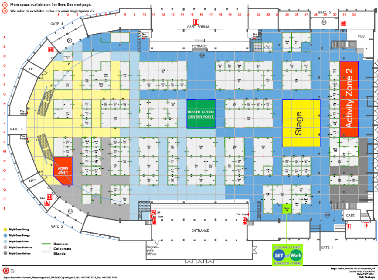
Position of SETatWork Stand (No. 90)

The venue for Bright Green is the historical exhibition Venue "FORUM" in central Copenhagen. SETatWork is on Stand No 90 to the right of the main entrance – as illustrated below: