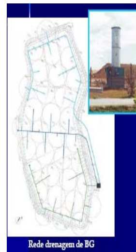
Rede drenagem de BG Drain pipe network