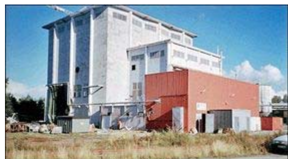
Figure 1 the CHP plant

The new CHP plant is utilising the fibre sludge from the nearby paper industry together with biomass (forestry residues) to generate heat to the district heating system, steam to the paper industry and electricity to the grid. The fibre sludge is a residue from the recycled paper that cannot be used for soft paper production but gives energy when combusted. Prior to this the sludge was disposed of at landfill. The concept is built upon proven technology but a similar CHP plant of this size had not been built before in Sweden